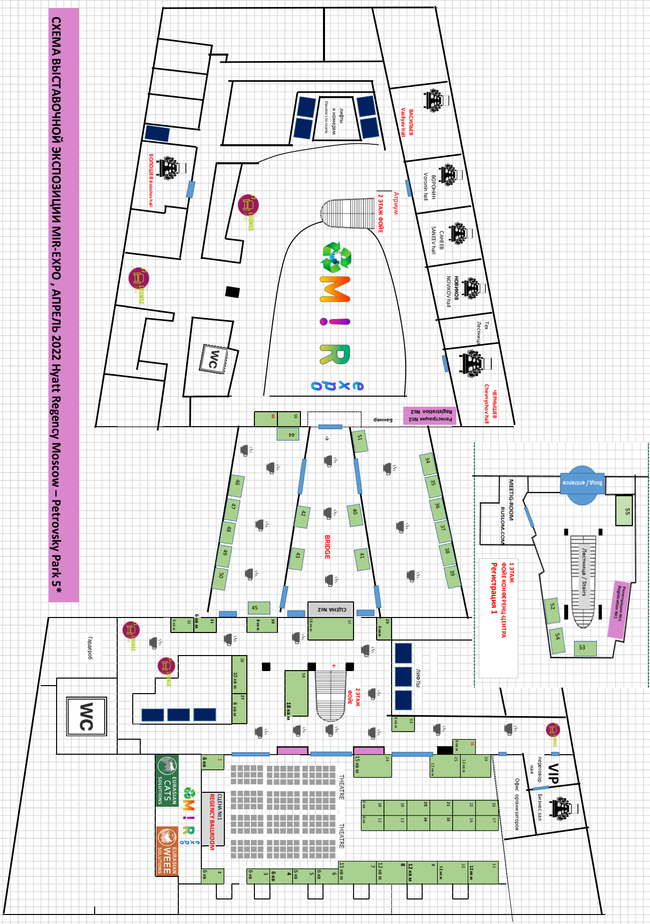
СХЕМА ВЫСТАВОЧНОЙ ЭКСПОЗИЦИИ MIR-EXPO, АПРЕЛЬ 2022 Hyatt Regency Moscow – Petrovsky Park 5*